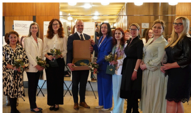
"Her Story" exhibition inaugurated in the city of Český Krumlov