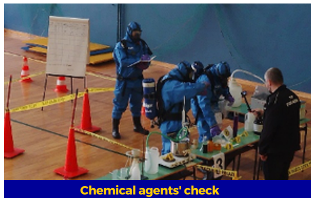
Chemical agents' check

The program, titled “Forensic Processing of a Crime Scene in a Specific CBRN Environment – CBRN Crime Scene 2025,” included a final demonstration of acquired skills on May 16. Two CBRN forensic trainers from Project P-57, together with five CSI colleagues from the Federal Police Directorate, trained 15 officers from key police units including forensics, special forces, and operational criminal technique. To ensure sustainability, a backup team will also be trained by the end of 2025. All 17 participants received certificates from the Federal Minister of Interior and the Director of the Police Academy, marking a significant step in developing national capacity to respond to CBRN incidents and contributing to future EU CBRN projects and judicial processes.