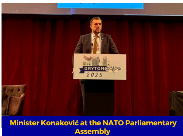
Minister Konaković at the NATO Parliamentary Assembly