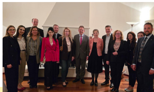
First Steering Committee Meeting

This event marked the start of intensified regional efforts in cyber diplomacy within the Partnership for Strengthening Cybersecurity, funded by the Federal Foreign Office of Germany and implemented by Deutsche Gesellschaft für Internationale Zusammenarbeit GmbH (GIZ). The initiative continues the efforts of the Berlin Process, focusing on addressing cross-border challenges through a cooperative regional approach.