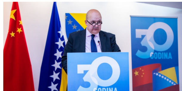
Acting Secretary of the Ministry of Foreign Affairs of Bosnia and Herzegovina, Edin Dilberović addressed the audience

Through three dedicated panels, the Conference highlighted the steady and comprehensive development of political, economic, and people-to-people ties between the two friendly countries. Participants emphasized that bilateral cooperation continues to deepen across all areas, grounded in mutual respect, trust, and shared interests. Representing the Ministry of Foreign Affairs of Bosnia and Herzegovina, Acting Secretary Mr. Edin Dilberović addressed the audience, underscoring the strength of the long-standing friendship and the dynamic cooperation between Bosnia and Herzegovina and the People's Republic of China, which continues to grow in all areas of mutual interest.