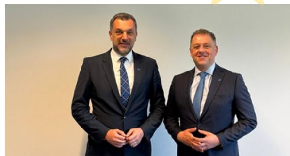
Minister Konaković and State Minister Thomas Byrne

He reiterated Ireland's determination to support the European Union's further expansion to the countries of the Western Balkans, emphasising that Ireland stands ready to share its knowledge and experience to support Bosnia and Herzegovina on its path to the EU.