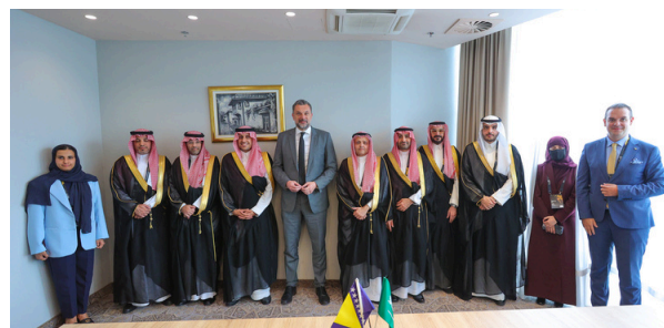
Minister Konaković with the delegation from the Kingdom of Saudi Arabia

The meeting focused on deepening bilateral economic cooperation, with an emphasis on expanding trade, attracting investments, and fostering collaboration in key strategic sectors. Particular attention was given to the halal industry, tourism, energy, and digital innovation, where both countries see considerable potential for growth and partnership. This high-level exchange reaffirmed the strong and friendly relations between Bosnia and Herzegovina and the Kingdom of Saudi Arabia, and underscored a shared commitment to building a prosperous future through enhanced economic ties.