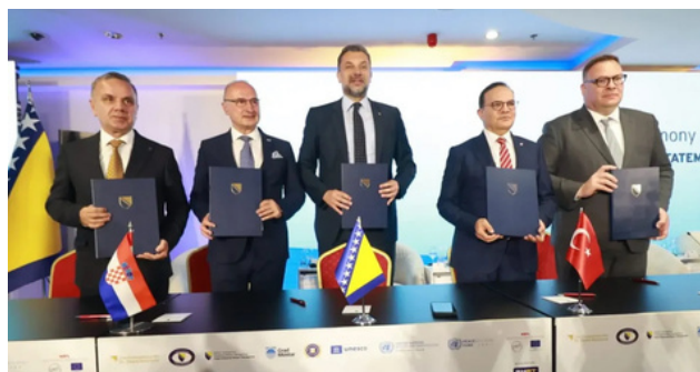
Signing of 2025 Mostarska Joint Statement