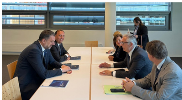
Minister Konaković with President Rousopoulos