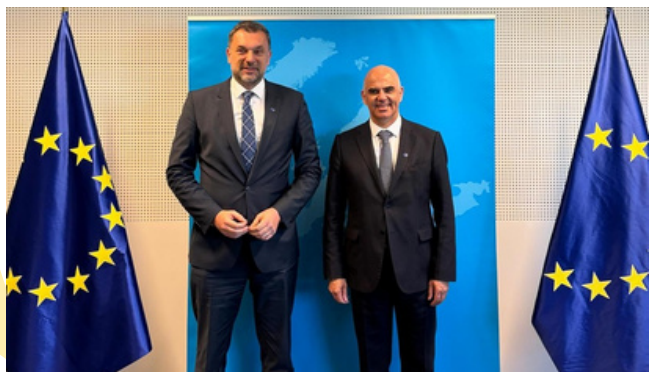
Minister Konaković with Secretary General Berset