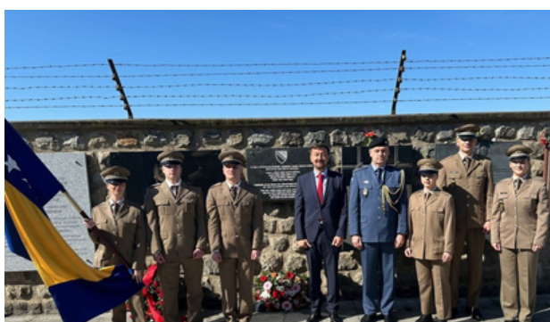
Exhibition "Persistence of Search"