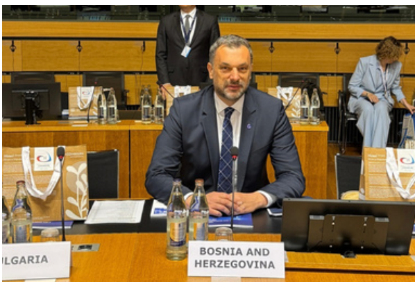
Minister Konaković at the Council of Europe in Luxembourg