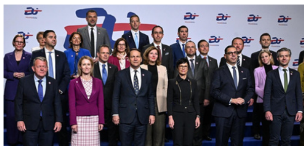
Ministers at the 2025 Warsaw informal meeting of EU Foreign Ministers