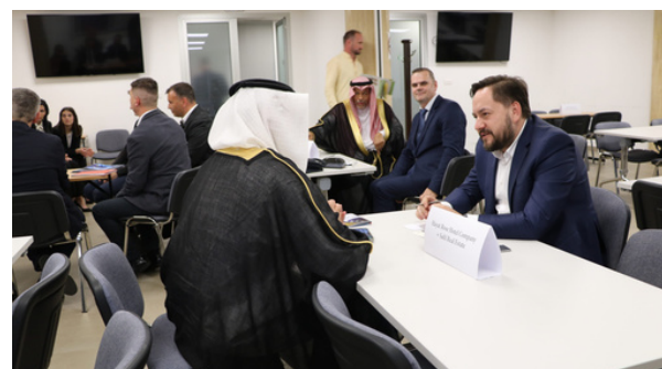
B2B meetings with representatives of 25 Saudi companies and institutions

The event also featured presentations on halal industry development and digital cooperation, underlining mutual interest in expanding economic collaboration.