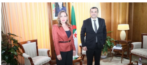
Ambassador Kondić Panić

Diplomacy remains the cornerstone of Bosnia and Herzegovina's international engagement, serving as a vital instrument for promoting national interests, peaceful cooperation, and advancing the country's integration into global political, economic, and cultural frameworks.