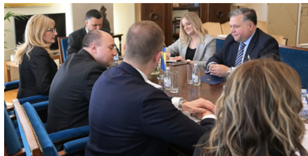
Deputy Minister Brkić meeting with the Secretary General of the Ministry of Foreign Affairs of the Republic of Serbia

The working meeting focused on the issues outlined in Annex B, within the succession process of the property of the former Yugoslavia. Participants underscored the importance of completing the division of property among the successor countries in a timely manner. Both sides also expressed their commitment to further advance and strengthen cooperation between the two countries.