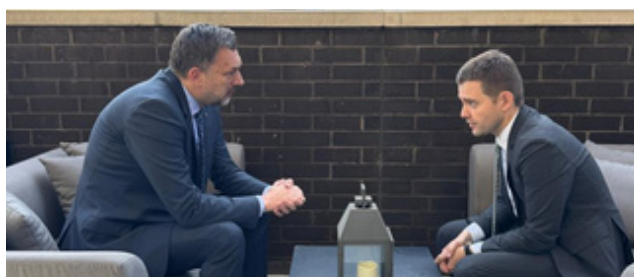
Ministers Elmedin Konaković and Timcho Mucunski