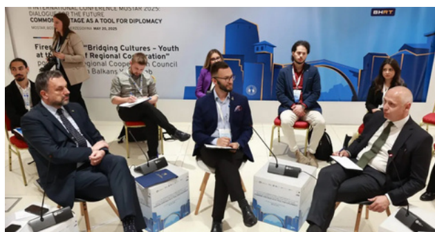
Fireside talk “Bridging Cultures – Youth at the Heart of Regional Cooperation”