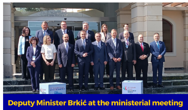
Deputy Minister Brkić at the ministerial meeting