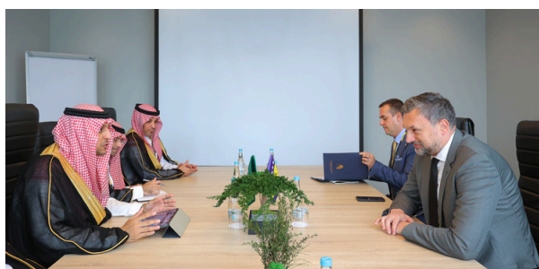
High-level meeting on the sidelines of the 14th Sarajevo Business Forum 2025

On the sidelines of the 14th Sarajevo Business Forum, Minister of Foreign Affairs of Bosnia and Herzegovina, Elmedin Konaković, met with Abdulaziz Alsakran, Deputy Governor for International Relations and Trade at the Saudi Authority for Foreign Trade. Mr. Alsakran led the Kingdom of Saudi Arabia's delegation on behalf of H.E. Dr. Majid Al-Qassabi, Minister of Commerce of Saudi Arabia.