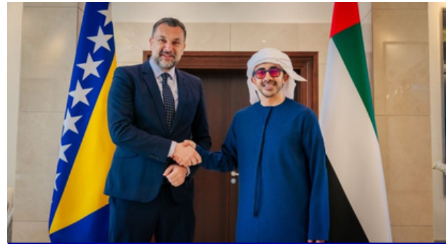
Minister Konaković with H.H. Sheikh Abdullah bin Zayed Al Nahyan

Minister Konaković presented recent developments in Bosnia and Herzegovina's political landscape, with a particular focus on the country's European integration process and initiatives aimed at fostering regional stability. He also encouraged Emirati investors to explore opportunities in Bosnia and Herzegovina, underscoring the significance of the UAE's participation in the upcoming Sarajevo Business Forum as a platform for concrete project engagement.