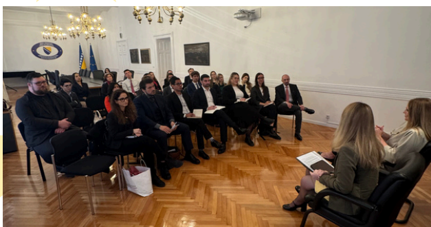
Discussion with the delegation from the Diplomatic Academy of Vienna