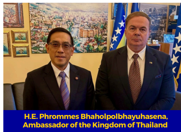
H.E. Phrommes Bhaholpolbhayahasena, Ambassador of the Kingdom of Thailand

The Ministry of Foreign Affairs expresses its readiness to support the diplomatic missions of the newly appointed ambassadors and to work jointly on advancing mutual interests and dialogue.