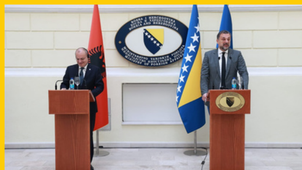
Press conference during the official visit