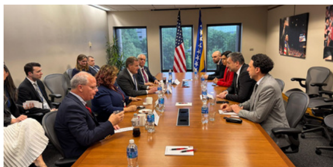
Minister Konaković with the delegation of the US Congress led by Congressman Michael Turner