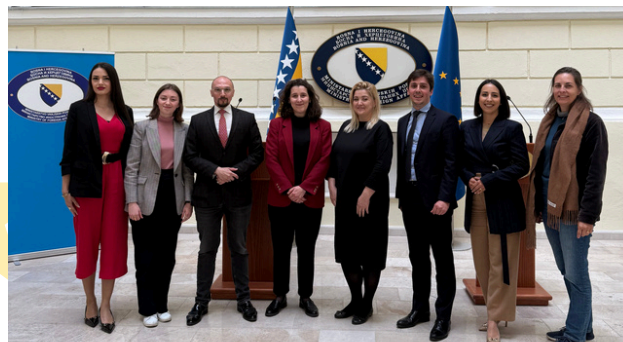
Young diplomats from the France visited the Ministry of Foreign Affairs

Young diplomats from the French Ministry of Foreign and European Affairs met with their counterparts from the Ministry of Foreign Affairs of Bosnia and Herzegovina at the MFA premises in Sarajevo. The meeting served as a platform for dialogue and mutual understanding, aimed at exploring each country's diplomatic structures and practices. This exchange was part of a broader visit by the French delegation to the Western Balkans, focused on strengthening ties with EU candidate countries. Discussions highlighted both shared challenges and differing approaches in diplomatic postings and institutional functioning. Participants emphasized the importance of such initiatives in building lasting professional networks. The event fostered a spirit of cooperation and opened avenues for future collaboration. It was a valuable step toward deeper integration and understanding within the European diplomatic framework.