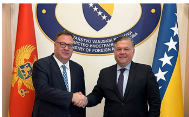
Bilateral consultations with the Ministry of Foreign Affairs of Montenegro