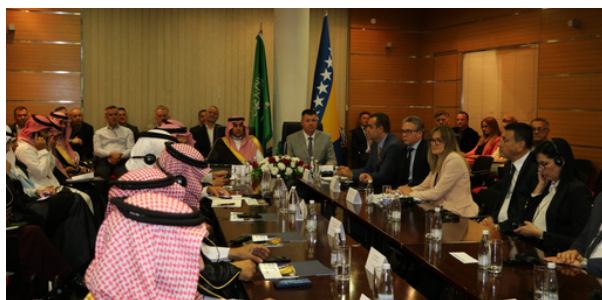
Bosnia and Herzegovina - Saudi Arabia Business Round Table

The meeting focused on deepening bilateral economic cooperation, with an emphasis on expanding trade, attracting investments, and fostering collaboration in key strategic sectors. Particular attention was given to the halal industry, tourism, energy, and digital innovation, where both countries see considerable potential for growth and partnership. This high-level exchange reaffirmed the strong and friendly relations between Bosnia and Herzegovina and the Kingdom of Saudi Arabia, and underscored a shared commitment to building a prosperous future through enhanced economic ties.