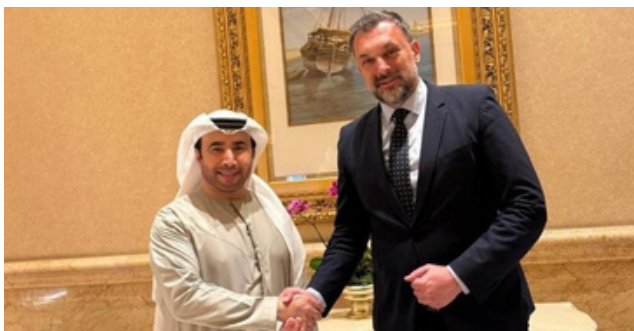
Interpol President Ahmed Nasser Al-Raisi and Minister Elmedin Konaković

In Abu Dhabi, Minister Konaković also met with the President of Interpol, Major General Ahmed Nasser Al-Raisi. The meeting took place against the backdrop of complex regional and global security dynamics.