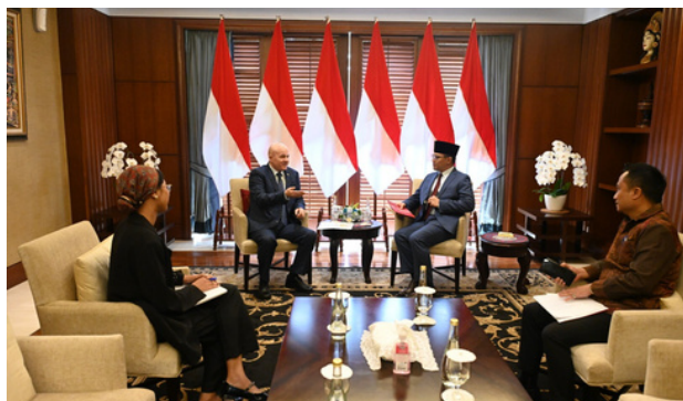
Ambassador Limo at the Ministry of Foreign Affairs of Indonesia