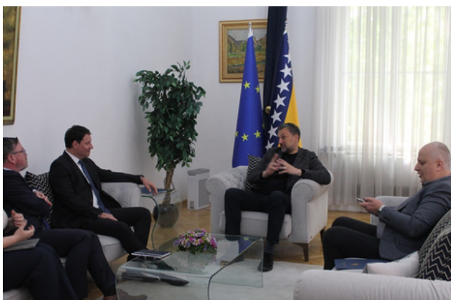
Minister Konaković met with the Special Envoy for the Western Balkans of the Republic of Slovenia Anžej Frangeš