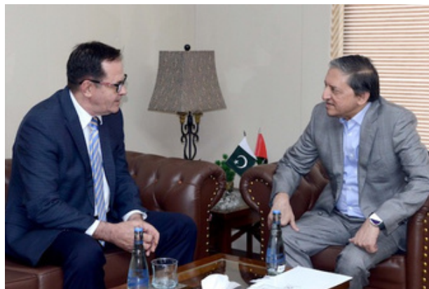
Ambassador Čohodarević meets Senator Mandviwalla

Ambassador of Bosnia and Herzegovina to the Islamic Republic of Pakistan, Emin Čohodarević, met with Senator Saleem Mandviwalla, Chief Whip in the Senate of the Islamic Republic of Pakistan and Chairman Senate Standing Committee on Finance and Revenue. During the discussion, Senator Madviwalla and Ambassador Čohodarević exchanged views on strengthening bilateral cooperation in key sectors. Both parties reaffirmed their commitment to deepening collaboration to foster mutual development.