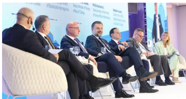
Diplomatic panel in Mostar