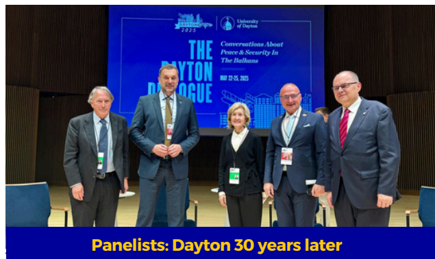
Panelists: Dayton 30 years later