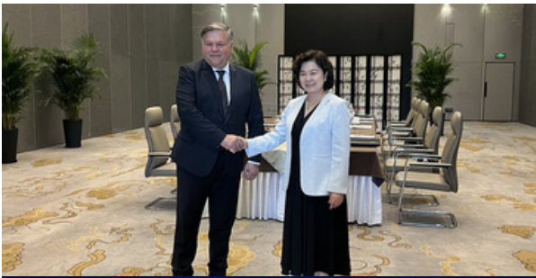
8 th political consultation between the Ministries of Foreign Affairs of Bosnia and Herzegovina and the People's Republic of China