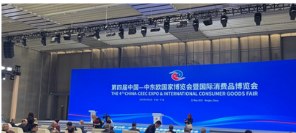
Deputy Minister Brkić at the CEEC Expo & China CEEC Cooperation Forum in Ningbo