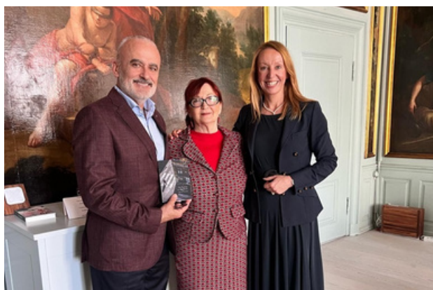
Book promotion in Denmark